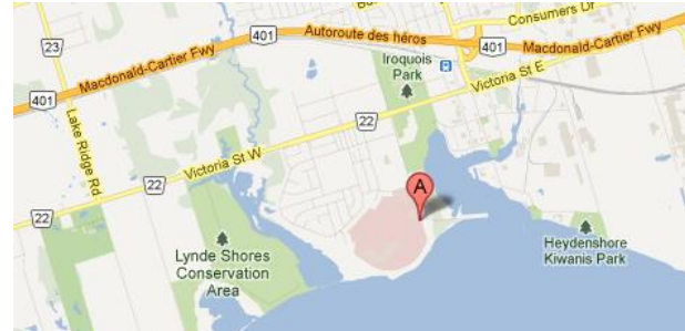
Ontario Shores Centre for Mental Health Sciences 700 Gordon Street Whitby, Ontario L1N 5S9